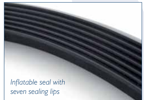
Inflatable seal with seven sealing lips

We are pleased to offer you our sealing system together with the supporting engineering; a solution that has already found applications in the most diverse range of industries.